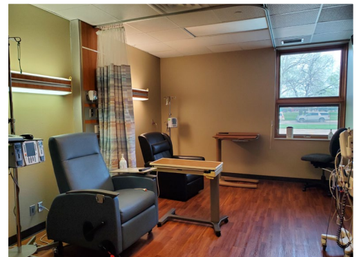
View of current infusion room