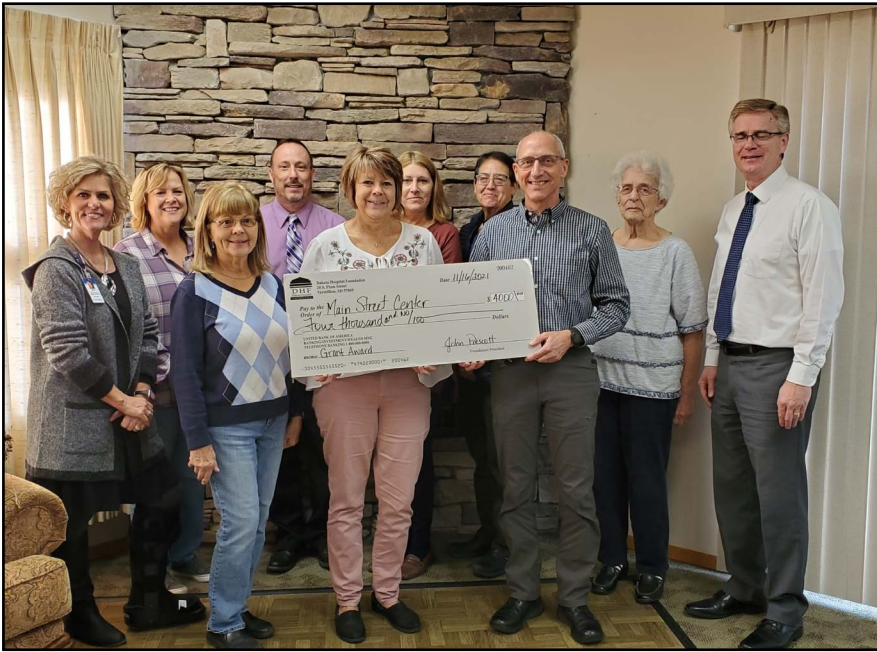
The Main Street Center awarded $4000 towards kitchen cupboard aesthetics.